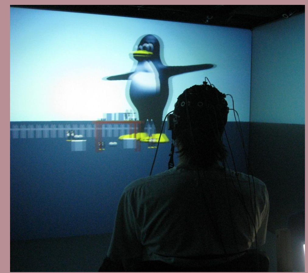
Figure 1: A participant interacting with a scene containing various virtual objects. The table (in red) is currently being flashed.

Instead of selecting a character or image from a regular grid, users were able to select the object itself using keeping a running mental count whenever their target object flashed.