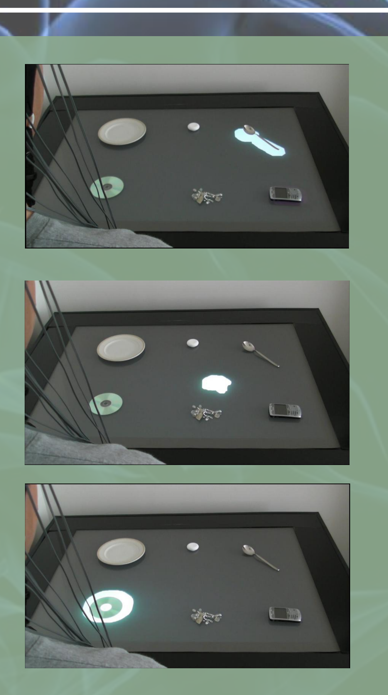
Figure 3: A participant interacting with the multi-touch table P300-based BCI. Six objects have been placed on the table. Top: The spoon is flashed by surrounding it with light. Centre: A non-object flash. Bottom: The area around the CD is being flashed.