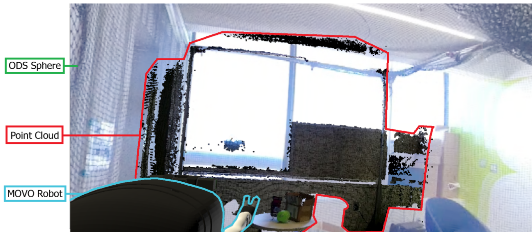
Figure 1: A scene inside the VR headset of a robot teleoperator, showing the 360° environment, point cloud from depth sensor, and rendered robot model. The operator controls the robot remotely by requesting arm and gripper poses using VR controllers.

Brown University Providence, Rhode Island, USA