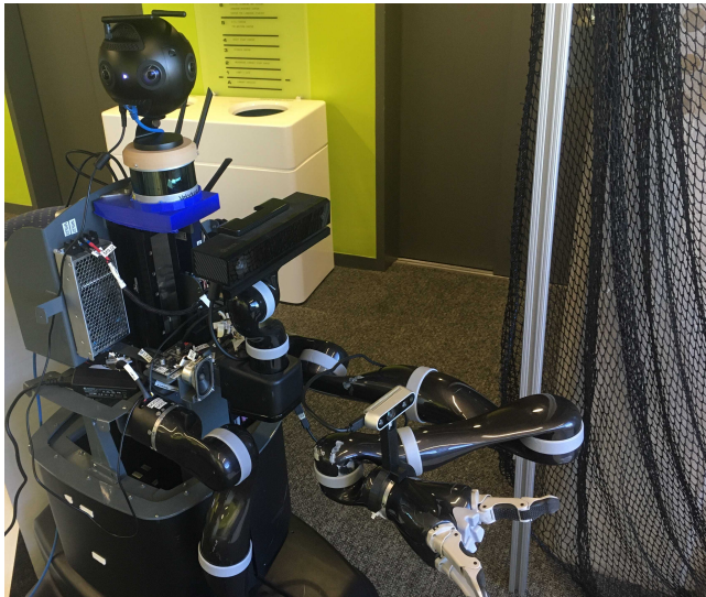
Figure 3: The MOVO robot with ODS camera, Kinect, and point cloud wrist camera.

images into a series of RGBA concentric sphere layers (Figure 2, right), called a multi-sphere image (MSI). MSIs provide a sense of depth and motion parallax to the user, as the spheres are transparent except at the depths at which objects in the scene appear. For this, the algorithm constructs a pair of sphere sweep volumes at fixed depths, then converts these to into alpha (transparency) values per layer through a deep convolutional network. Given the MSI, the pose of the rendered view is updated in real time based on the VR headset’s 6DoF pose within the sphere, which increases user comfort and reduces disorientation. As the spheres are computationally cheap to render, they give the operator 360° 6DoF viewing in real time independently of the CNN inference speed. We have