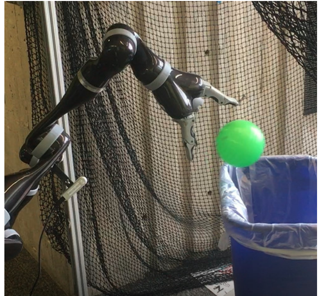
Figure 4: A new user was able to pick and place objects within minutes of using the system, here picking up and dropping a green ball into a bucket.

We believe a robust 3D environment with human-like control supporting movement options represents the next step in teleoperation. However, movement in three dimensions and especially remote control presents unique challenges in spatial awareness and operator control. Our research work is intended to discover and implement interfaces that allows an operator to better teleoperate a robot. Thus far, we have been able to introduced a new human operator to our visualization and control mechanisms and allow them to control the robot from their own home using a set of intuitive controls and a low-cost ($300) VR headset and controllers.